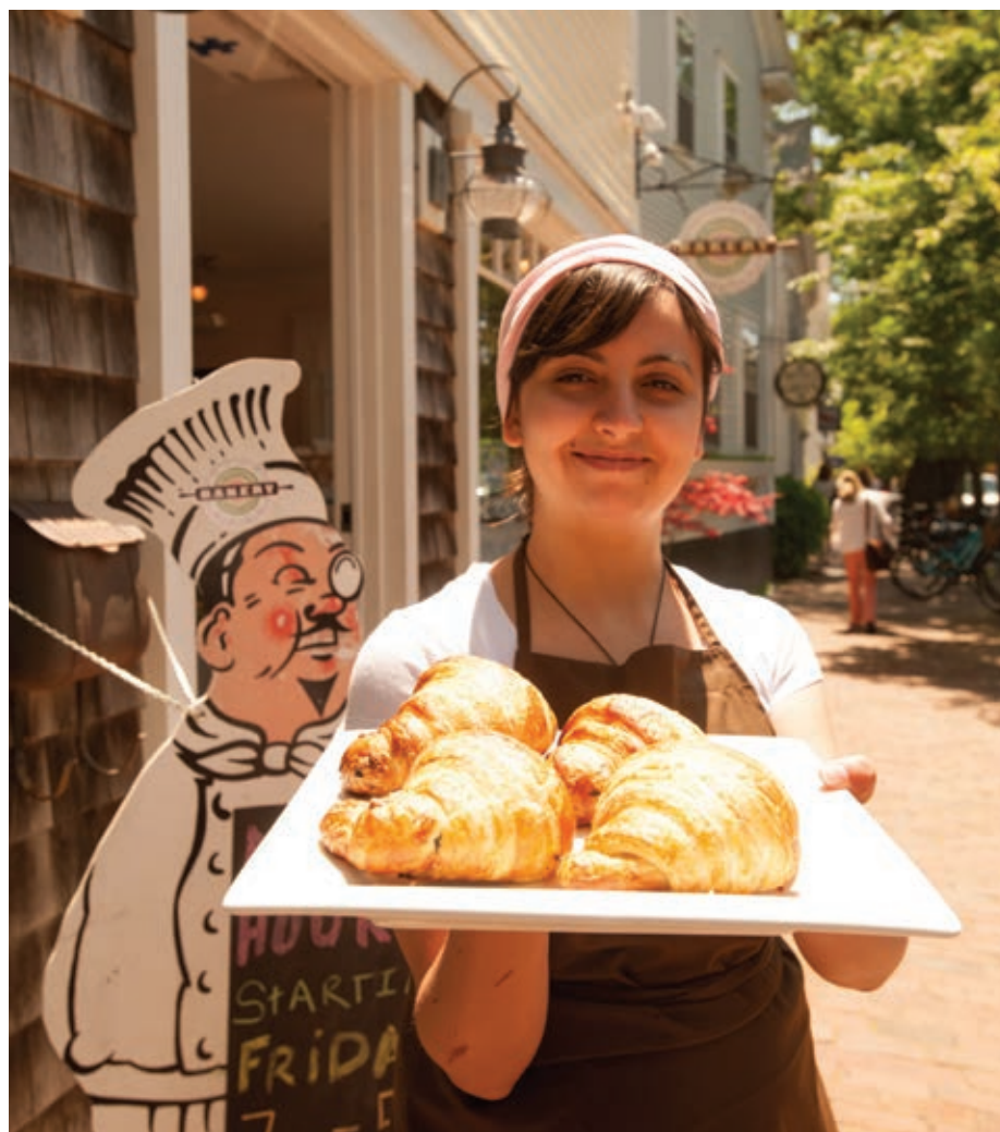
LEFT: Savour freshly baked croissants at a bakery on Centre Street in Nantucket.