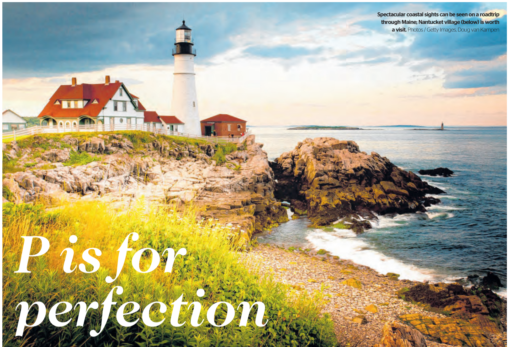
Spectacular coastal sights can be seen on a roadtrip through Maine; Nantucket village (below) is worth a visit.